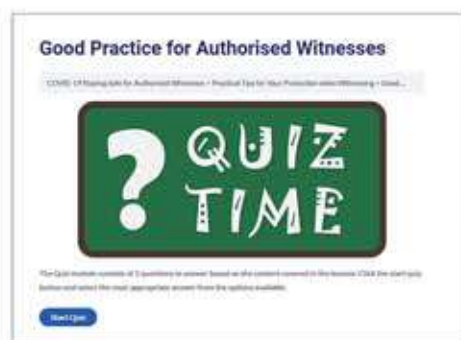
Quizzes Help You Lock In the Learning