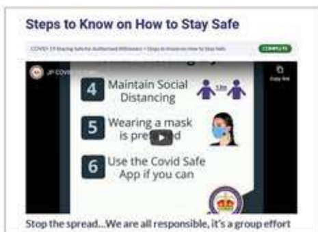
Short Videos Explain what you need to know

RVAHJ recommends that every JP and BJ take this course. It will help you look after yourself and the people who need documents witnessed.