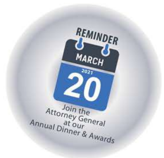
Hon Jill Hennessy MP Attorney-General Minister for Workplace Safety

A handwritten signature in blue ink that reads "Jill Hennessy".