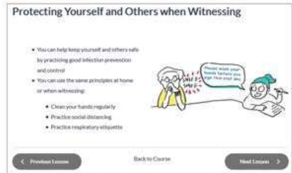
The Online Course Makes Learning Easy and Fun!