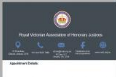
Optional Business Card Back