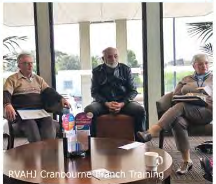
RVAHJ Cranbourne Branch Training

"the session was well received, and it was great to see an engaged group of attendees!" "thankyou once again for presenting for us. We will continue to be in touch in relation to opportunities for future LIV CPD"