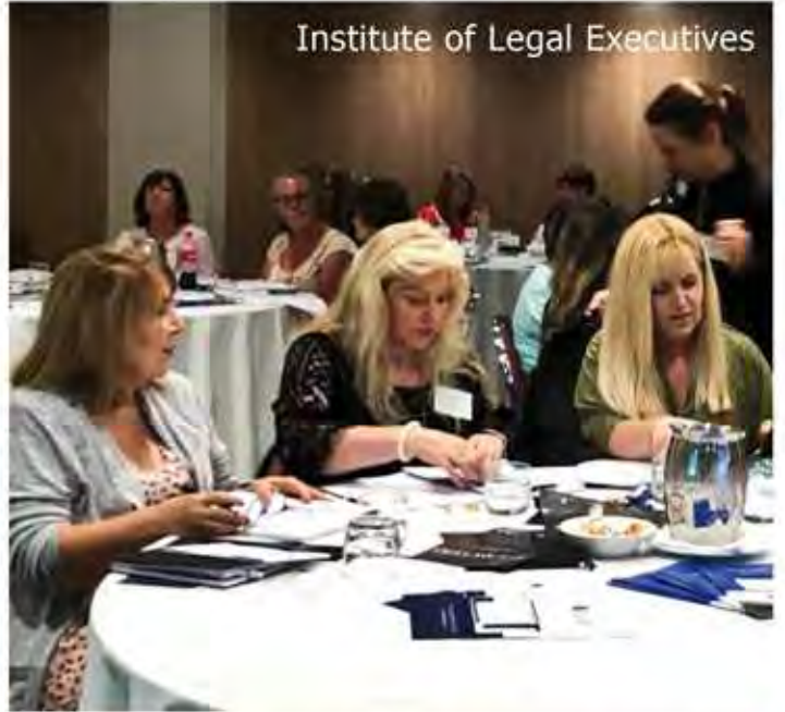
RVAHJ Yarra Valley Branch Training