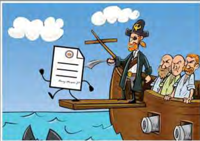
Witnessing the Execution of a Document