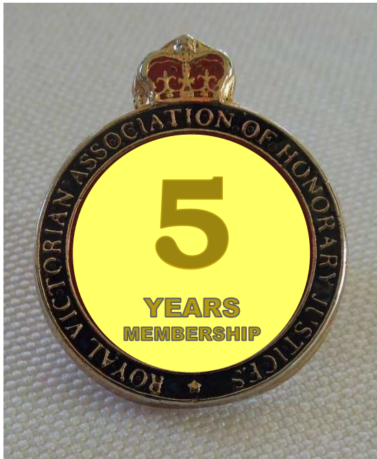
Sample drawing only - greatly enlarged

We shall require a minimum number of badges ordered to make this happen, so please complete and return your order soon.