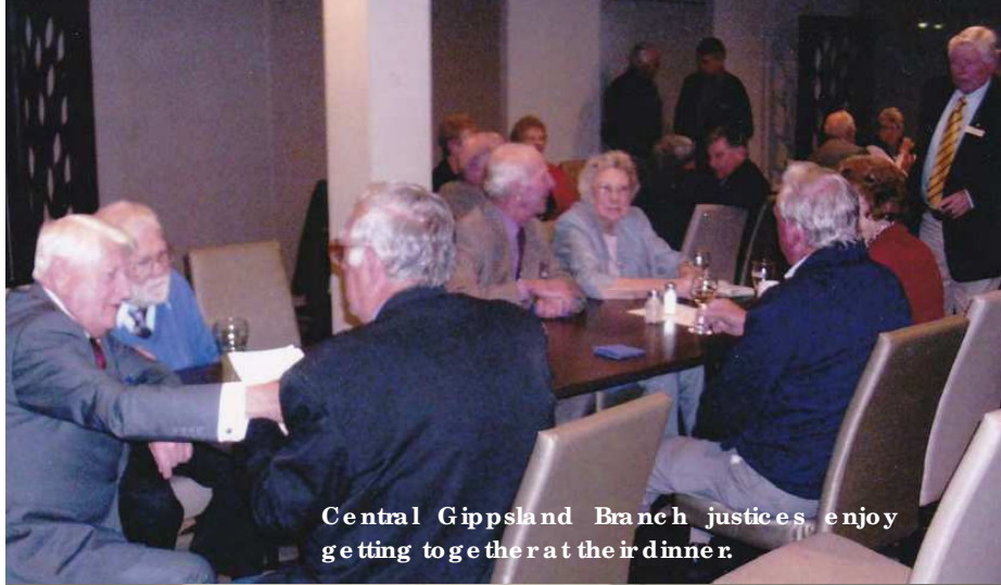
Central Gippsland Branch justices enjoy getting together at the dinner.