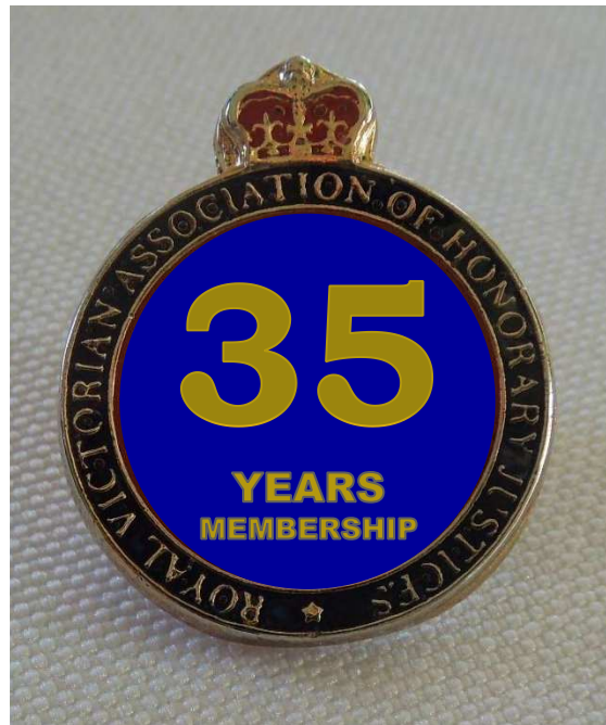
Sample drawing only - greatly enlarged