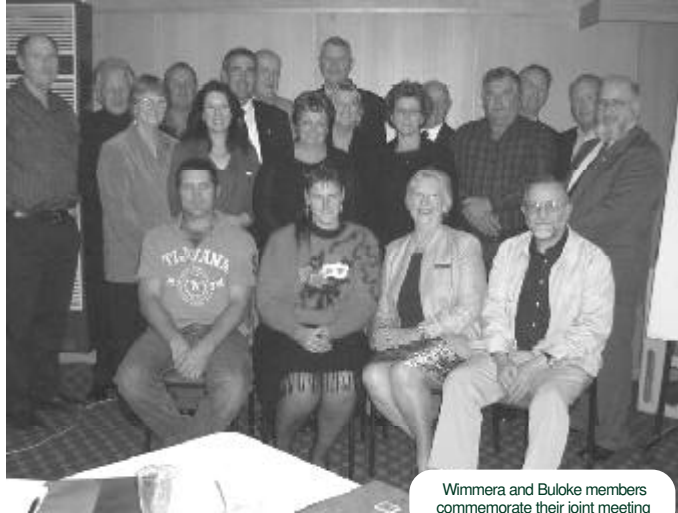
Wimmera and Buloke members commemorate their joint meeting

Twenty-one members were in attendance (though one rascal escaped in time to avoid being photographed). Lovely food and intriguing